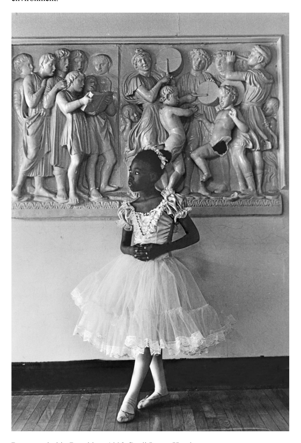
Dance recital in Brooklyn. 1992.

He added: "It's almost like fishing, you've got a fishing line in the water and you really dig in and see what you can catch. You're always on the prowl looking for stuff in the midst of the great and big environment."