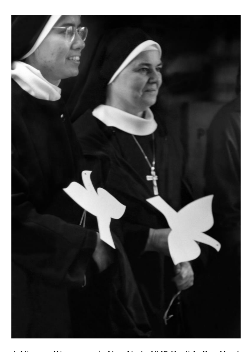
A Vietnam War protest in New York. 1967.