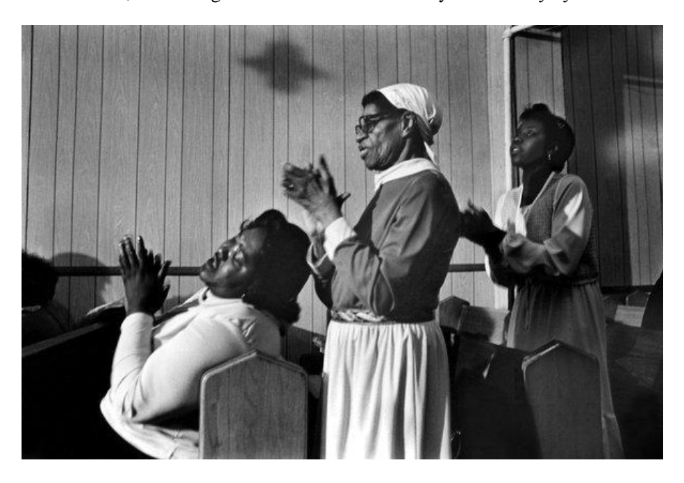
A storefront Baptist church in Brooklyn. 1977.

birthday and later studied photography at the School of Visual Arts in New York City. "I was looking for visual drama, something in the midst of the ordinary to catch my eye."