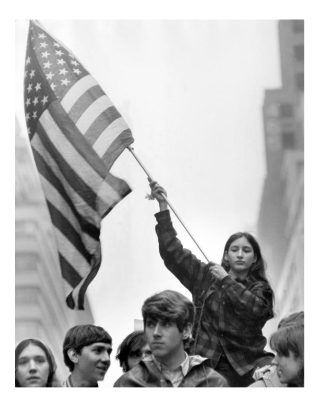
Anti-Vietnam War rally in New York. 1967.