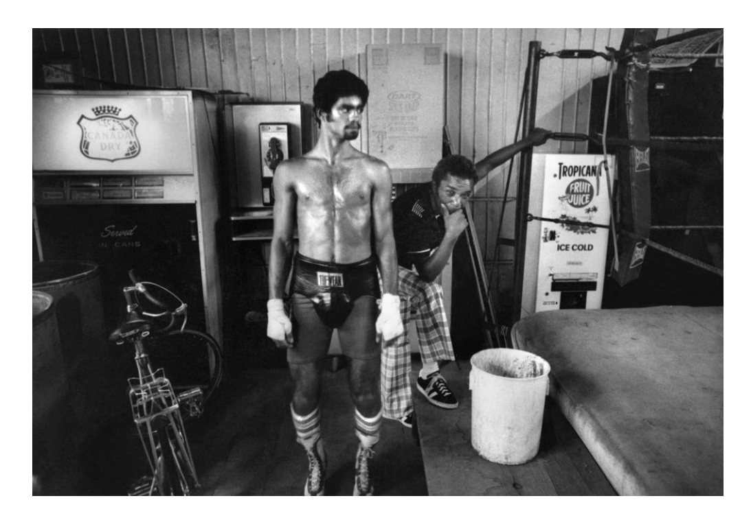
Fighter with a trainer at Old Gleason Gym in New York. 1979.