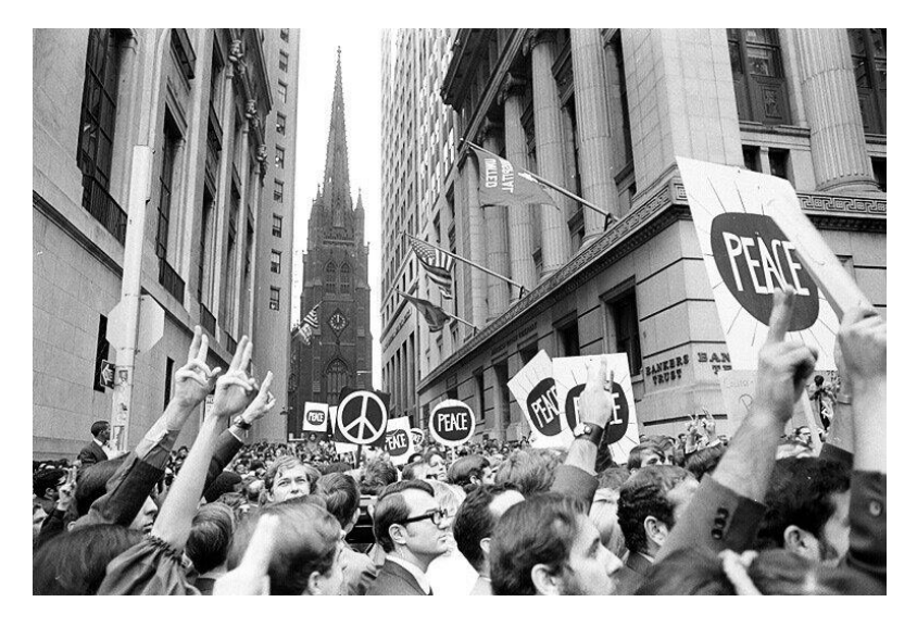
Anti-Vietnam War demonstration in New York City, 1967.

"A photographer's job is to see the beauty and the importance in everyday moments. It's up to me to see every moment for what it really is."