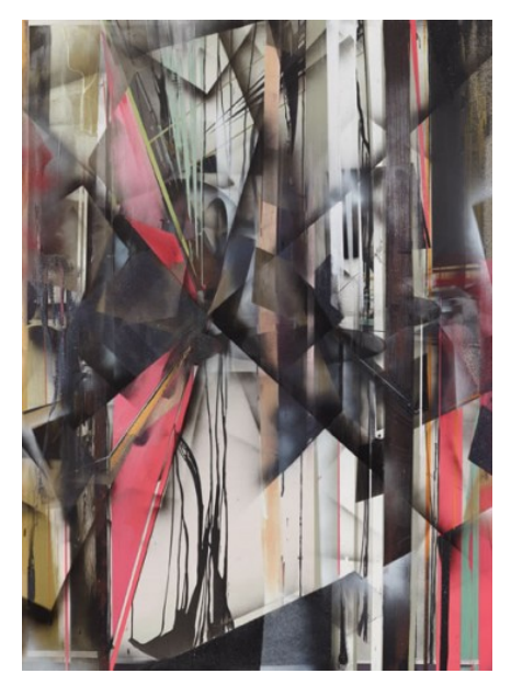
Nola Zirin. Suspension . Oil, enamel and glitter on canvas, 72 x 52 in.

Nola Zirin's recent solo exhibition titled Stardust features fifteen new works that introduced fifteen new paintings that introduced a unique, visual dynamism into the genre of abstraction while still reflecting the artist's signature layering process. Zirin rephrases pictorial space by exploring sweeping, painterly gestures that are set at sharp angles, creating a suggestion of three-dimensional space, placeless but familiar within the experience of one's subjective perception. Along with four very small collages Stardust presented eight large-scale paintings that wove glitter into painted surfaces, touching upon the flicker of