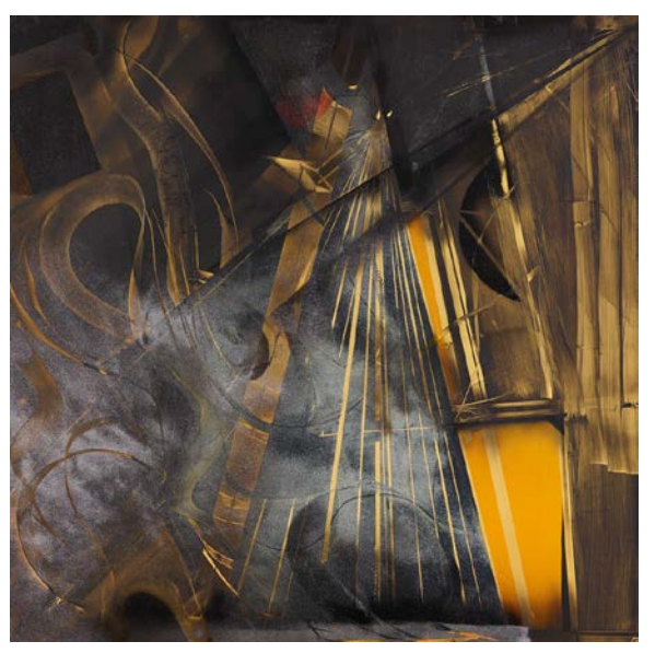
Zirin-Voyager 2013 oil enamel and glitter on canvas 60 x 60 inches.

The smoky atmosphere rendered in Voyager shows a swirl of gold and yellow paint shining across a black surface, laced with a white silhouette. Within this space measuring five-feet square, dark golden shades swirl and dance across the painting's far left margin as hints of industry and time fall to the center.